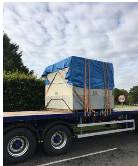
Figure 3: Empty Concrete Box Transport

This equates to around 14 HGV deliveries of size-reduced skips.