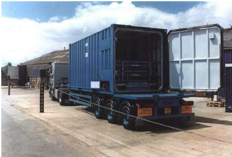
Figure 2: Empty Croft Container for the Transport of Skips

The concrete boxes would be delivered one or two per HGV. Taking the worst-case scenario, the maximum number of vehicle deliveries to HPA would be around 45 deliveries (around 90 vehicle movements).