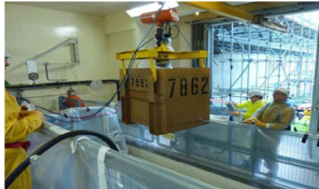
Figure 1: Skips before Size Reduced

The skips themselves are the waste. There is no more waste inside the skips.